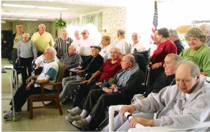
Veterans at Burnt Tavern Manor at Veteran's Day Ceremony