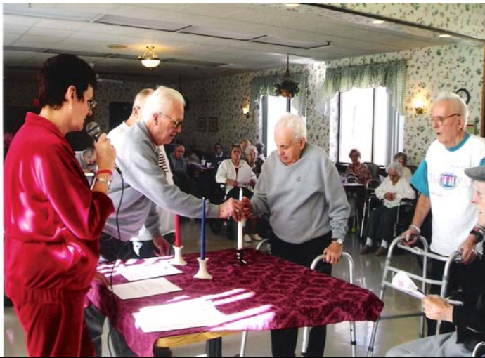
THE VETERAN'S DAY CANDLE CEREMONY AT BURNT TAVERN REHAB CENTER