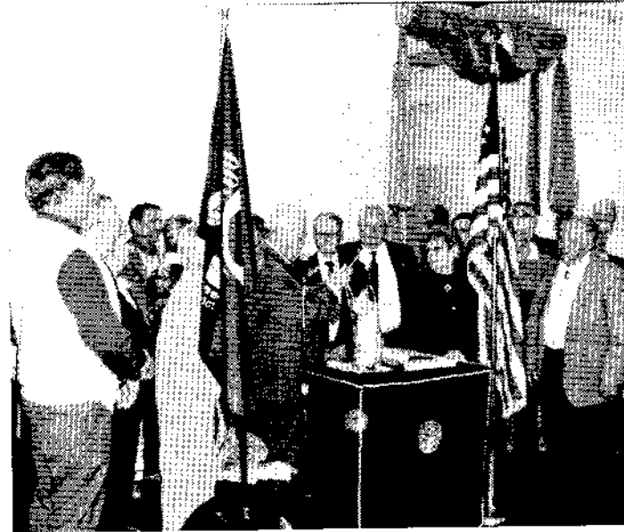
The Veteran's Committee