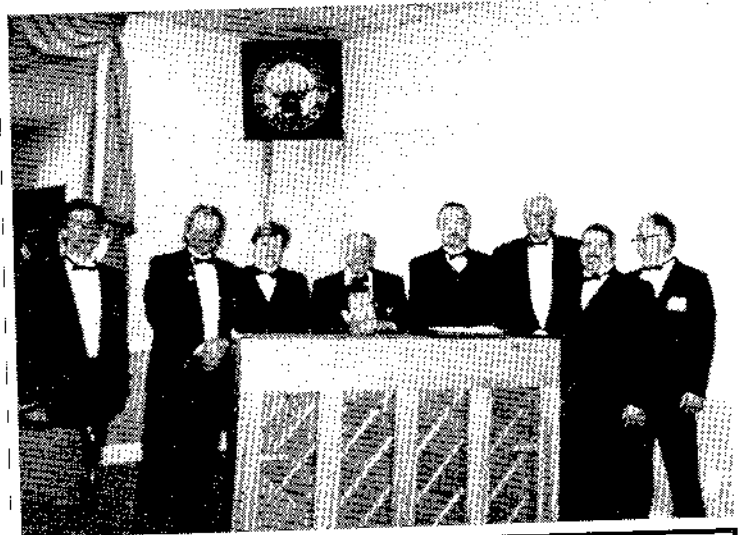
Our Annual Memorial Service, as mandated by Grand Lodge, was held on December 4th at 11 AM by the Lodge Officers. Breakfast was served to the attendees afterwards.

I am having trouble covering all our Lodge events by myself. I need help! Please contact me if you are able to cover any events by either writing articles, taking pictures or helping in the distribution of the Antler. My e-mail address is: jchickene@verizon.net and my phone number is: 732-840-0891.